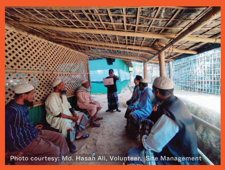
Majhi discussing at block after getting orientation

orientation workshops for Majhis in the CiC office. Majhis get oriented about the significance of family planning. Subsequently, they disseminate this important message throughout the Rohingya community.