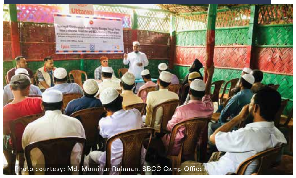
Imam orientation meeting

In the Rohingya camp area, Imams (people who lead prayers in a mosque) hold significant influence within the Rohingya community. To increase awareness and accessibility of SRH in humanitarian situations, Ipas Bangladesh has developed an innovative approach that heavily involves Rohingya Imams. The SBCC team of Ipas regularly sets up easy-to-understand workshops