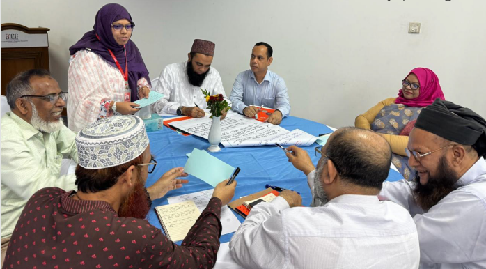
Participatory session of the workshop

comprehensive reproductive health education. The workshop aimed to forge a strategic partnership among DGFP, the Islamic Foundation, and Ipas Bangladesh to promote SRHR interventions. This partnership seeks to integrate Islamic perspectives to ensure wide recognition and implementation across Bangladesh, from local communities to the national level.