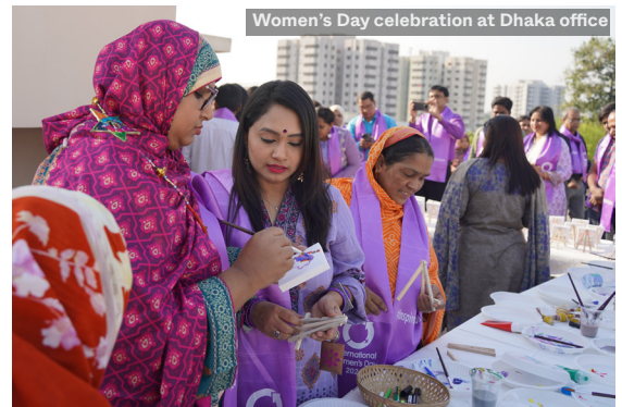
Women's Day celebration at Dhaka office