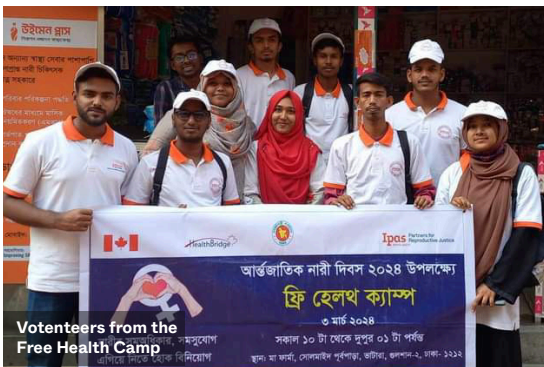
Volunteers from the Free Health Camp