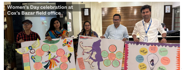
Women's Day celebration at Cox's Bazar field office