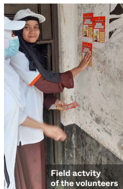
Field activity of the volunteers