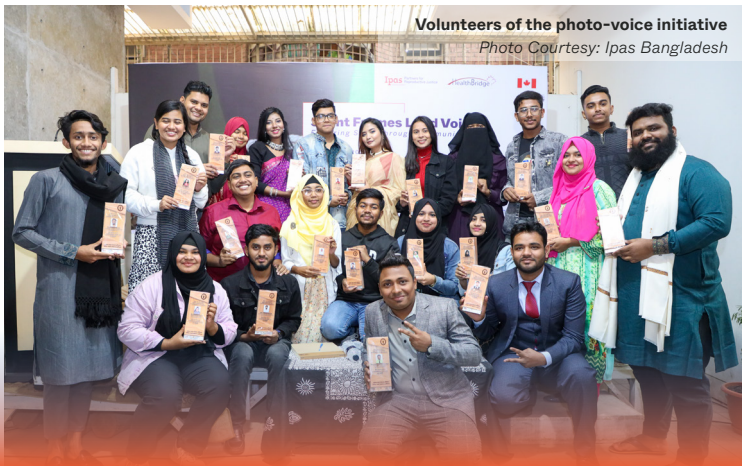
Volunteers of the photo-voice initiative