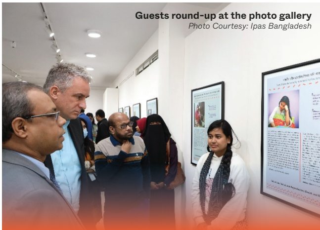
Guests round-up at the photo gallery