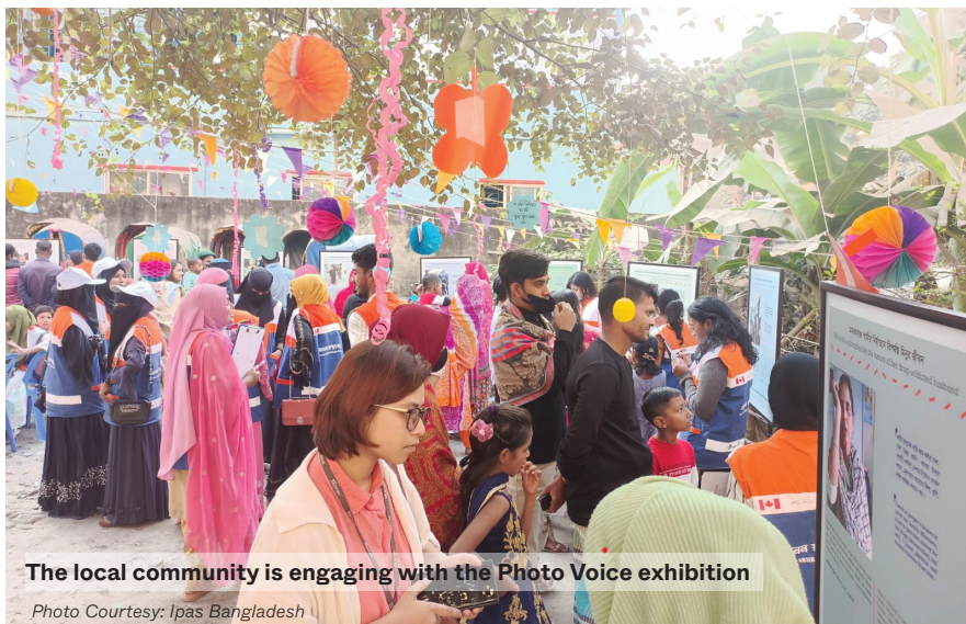
The local community is engaging with the Photo Voice exhibition

The Improving SRHR in Dhaka Project organized two interactive Community Photovoice Exhibitions—one at low socio-economic areas of Mohammadpur and another in Bongshal's Muslim Colony, Dhaka in December 2024. Led by youth volunteers, these open space exhibitions used storytelling to engage community members, fostering discussions on early marriage, gender-based violence, and unintended pregnancies. Participants connected the stories to their lived experiences, sharing insights and solutions to address these critical issues. The events strengthened community awareness and inspired collective action for positive change.