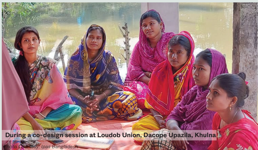
During a co-design session at Loudob Union, Dacope Upazila, Khulna

The first round of co-design workshops was conducted following User Centered Design (UCD) approach in the remotest Dacope upazila of Khulna district in the southern part of Bangladesh adjacent to the Sundarbans during 22-27 December 2024 to develop the intervention