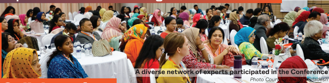
A diverse network of experts participated in the Conference