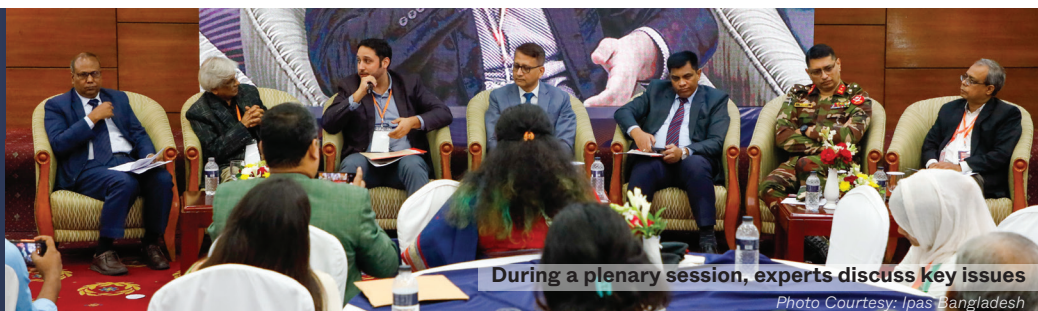
During a plenary session, experts discuss key issues