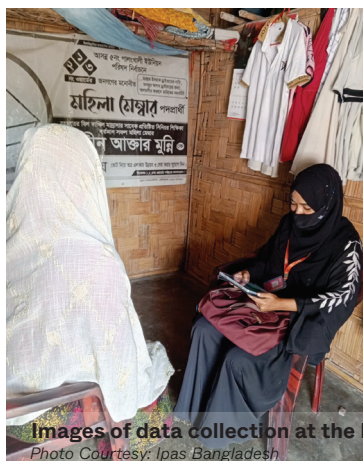
Images of data collection at the Rohingya camp