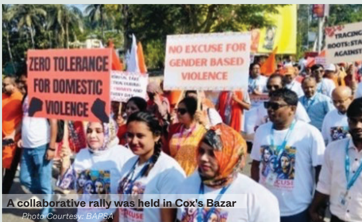
A collaborative rally was held in Cox's Bazar