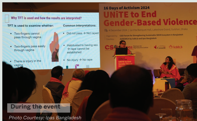
During the event