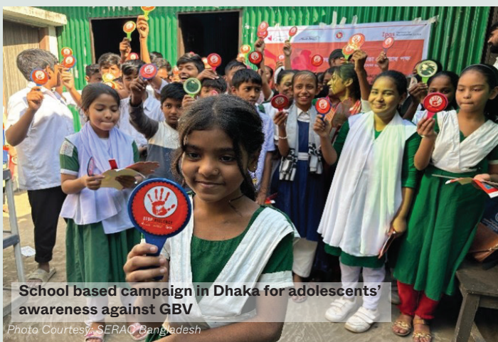
School based campaign in Dhaka for adolescents' awareness against GBV

Ipas Bangladesh commemorated the 16 Days of Activism Against Gender-Based Violence (GBV) under the theme 'UNITE to End GBV' in 2024. To raise awareness and drive action, a series of events were held from November 25 to December 10, engaging policymakers, public health professionals, CSOs,